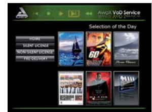
Sample user interface on a web browser.